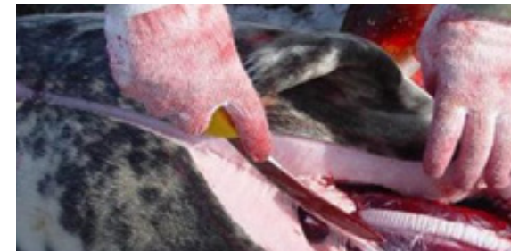
Normal white colour and thickness of blubber, grey seal.